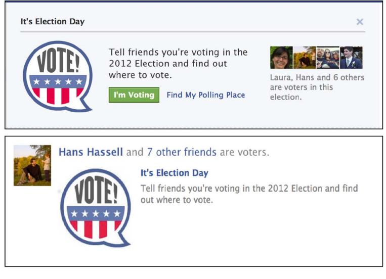
Fig 1. Example messages shown to adult Facebook users in the United States on election day 2012. The top message was shown to users in the "banner" condition at the top of their News Feed. The bottom message was shown to users in the "feed" condition within their news feed if at least one of their friends in the "banner" condition had clicked on the "I'm Voting/I'm a Voter" button.

https://doi.org/10.1371/journal.pone.0173851.g001